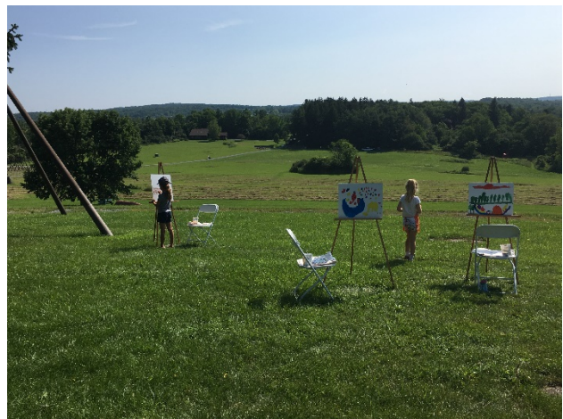
Young artists learn about plein air painting at the Hal Welsh East Area Family YMCA's Art Camp for kids, July 2019.