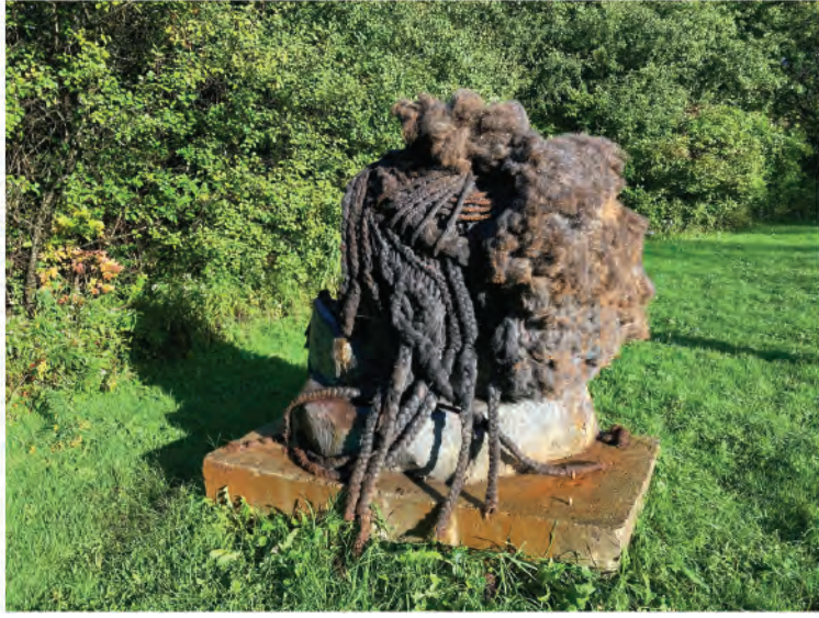
Jen Dawson making Super Natural and the completed sculpture.