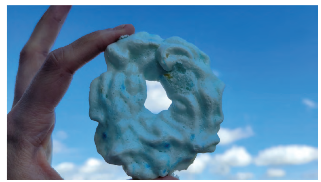
A participant viewing the sky through a meringue viewfinder.

A participatory experience of sky viewing made by artist collective DP Manny.